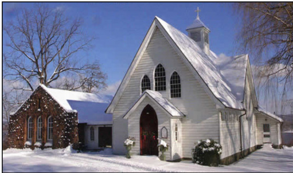
Chapel of St. John the Divine, Tompkins Cove